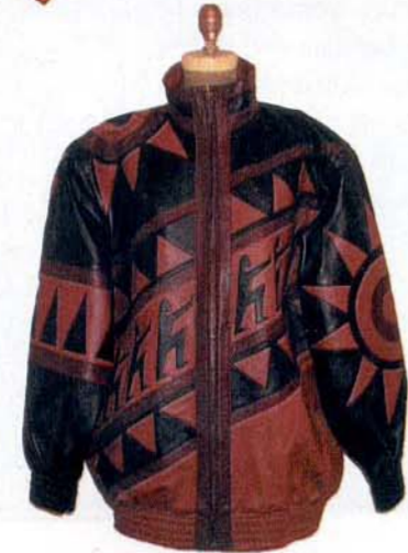
FAR LEFT: Aztec swing coat, sizes 8-24. Retail price: $899. Dress to accompany coat, $299.