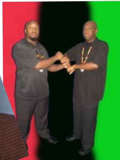
Brotha's Keepa Spoken Word Artists Memphis, TN