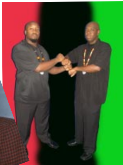
Brotha's Keepa Spoken Word Artists Memphis, TN