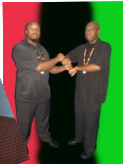
Brotha's Keepa Spoken Word Artists Memphis, TN