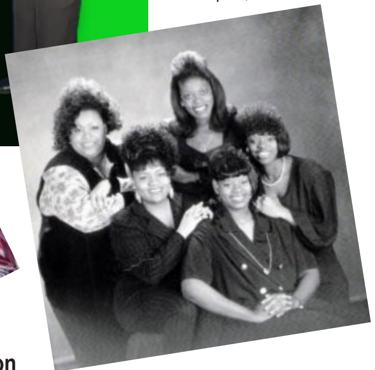
The Valley Girls Gospel Performers Valley, AL